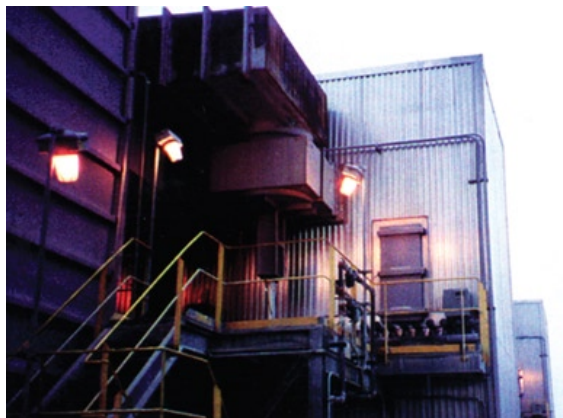
HTH installed the insulation and lagging on this mixing tower at a chemical processing plant

Hellebusch offers the following advice to companies currently in the market for accounting software: "You need to ask the right questions," she said. "For example, is it construction-specific... and is it date-sensitive? Does it track the data you need and produce the kinds of reports you require? Finally, you should expect it to be flexible enough to grow along with your business."